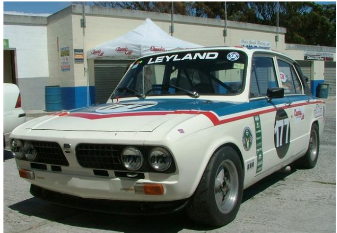
A racing Dolomite Sprint seen at the racing, unfortunately the motor had problems and due to a lack of spares will be going back to the UK