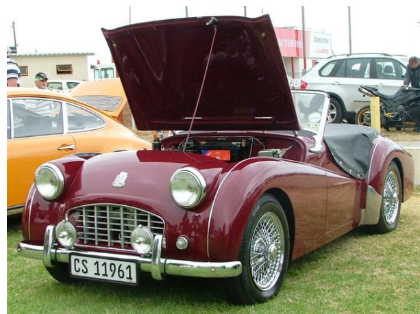
The Killarney concourse winning TR3